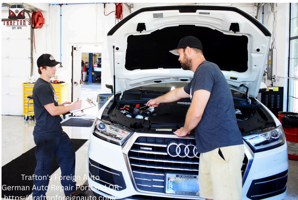
Trafton's Foreign Auto German Auto Repair Portland OR https://traftonforeignauto.com/

That does now not warrantly perfection. Every car can shock you. Even skilled authorities run into bizarre instances. But journey reduces wandering. The paintings will become much less about exploring the unknown and more about confirming the possibly reason with discipline.