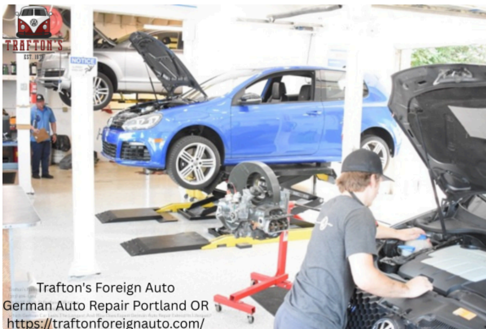
Trafton's Foreign Auto German Auto Repair Portland OR https://traftonforeignauto.com/

Water intrusion is a great example of the roughly aspect that frustrates homeowners and retail outlets alike. The symptom would seem unrelated to the supply. One proprietor notices a musty smell. Another stories random electrical habits. Someone else in simple terms complains that the windows fog extra than familiar. By the time the automobile reaches a technician, the fault can even appear electric notwithstanding the originating predicament used to be moisture access. A save skilled in import automobile restore is much more likely to determine that chain truly.