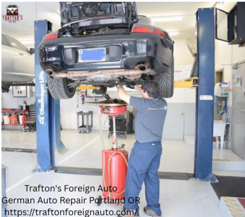
Trafton's Foreign Auto German Auto Repair Portland OR https://traftonforeignauto.com/